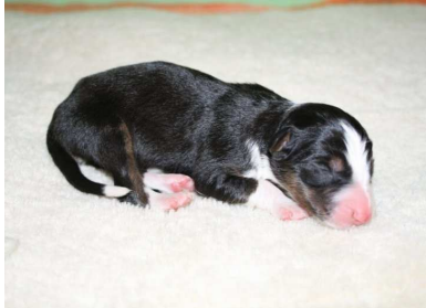
B & Brindle & W