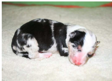
Blue merle (trikolor?)