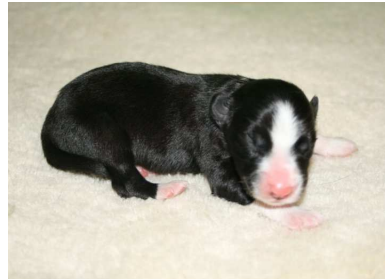
B & W