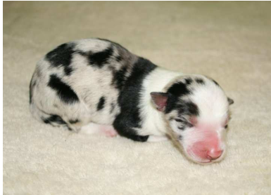
Blue merle tricolor