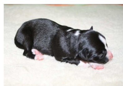
B & W