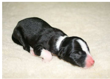
B & W